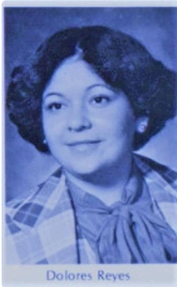
Fastest typist in South Houston High School's VOE program c. 1978. I did her hair for the photo.